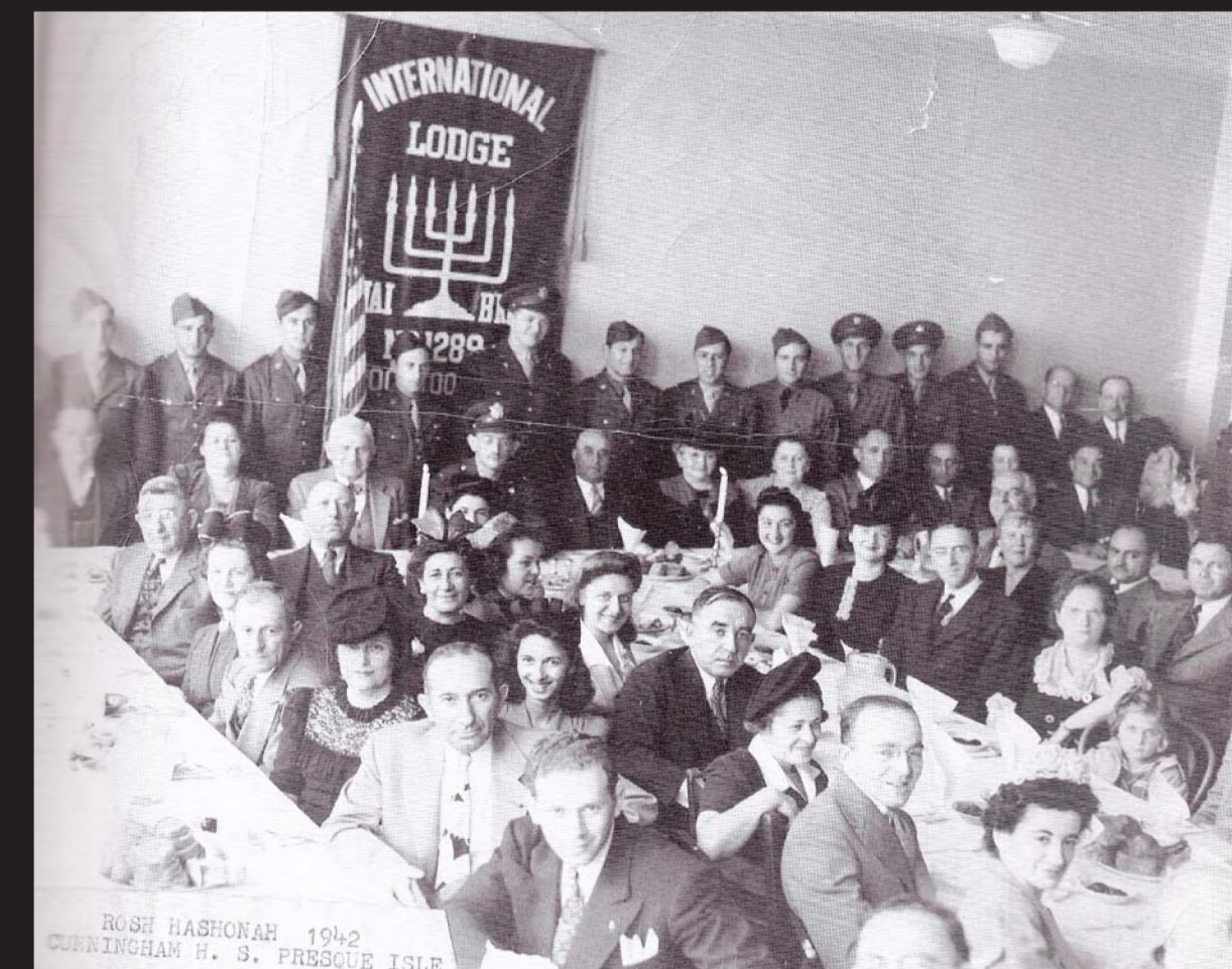
Rosh Hashanah celebration in Presque Isle

Individuals across the state are supported by an array of Jewish communal and cultural organizations, such as the Jewish Community Alliance of Southern Maine and the Bangor Jewish Community Council. Jews also come together around Hillel organizations at the University of Maine and Bates, Bowdoin and Colby Colleges. In more isolated and rural corners of Maine, Jews committed to their faith and heritage find ways to maintain and express their Judaism in the absence of a minyan (minimum gathering) of ten.