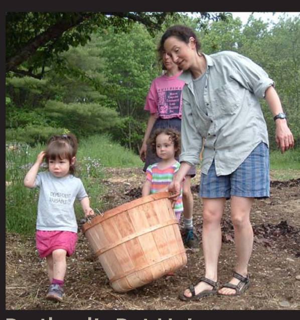
Portland’s Bet Ha’am members volunteer for Cultivating Community