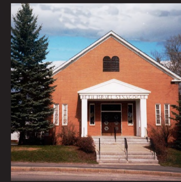
Beth Israel Synagogue in Waterville

Individuals across the state are supported by an array of Jewish communal and cultural organizations, such as the Jewish Community Alliance of Southern Maine and the Bangor Jewish Community Council. Jews also come together around Hillel organizations at the University of Maine and Bates, Bowdoin and Colby Colleges. In more isolated and rural corners of Maine, Jews committed to their faith and heritage find ways to maintain and express their Judaism in the absence of a minyan (minimum gathering) of ten.