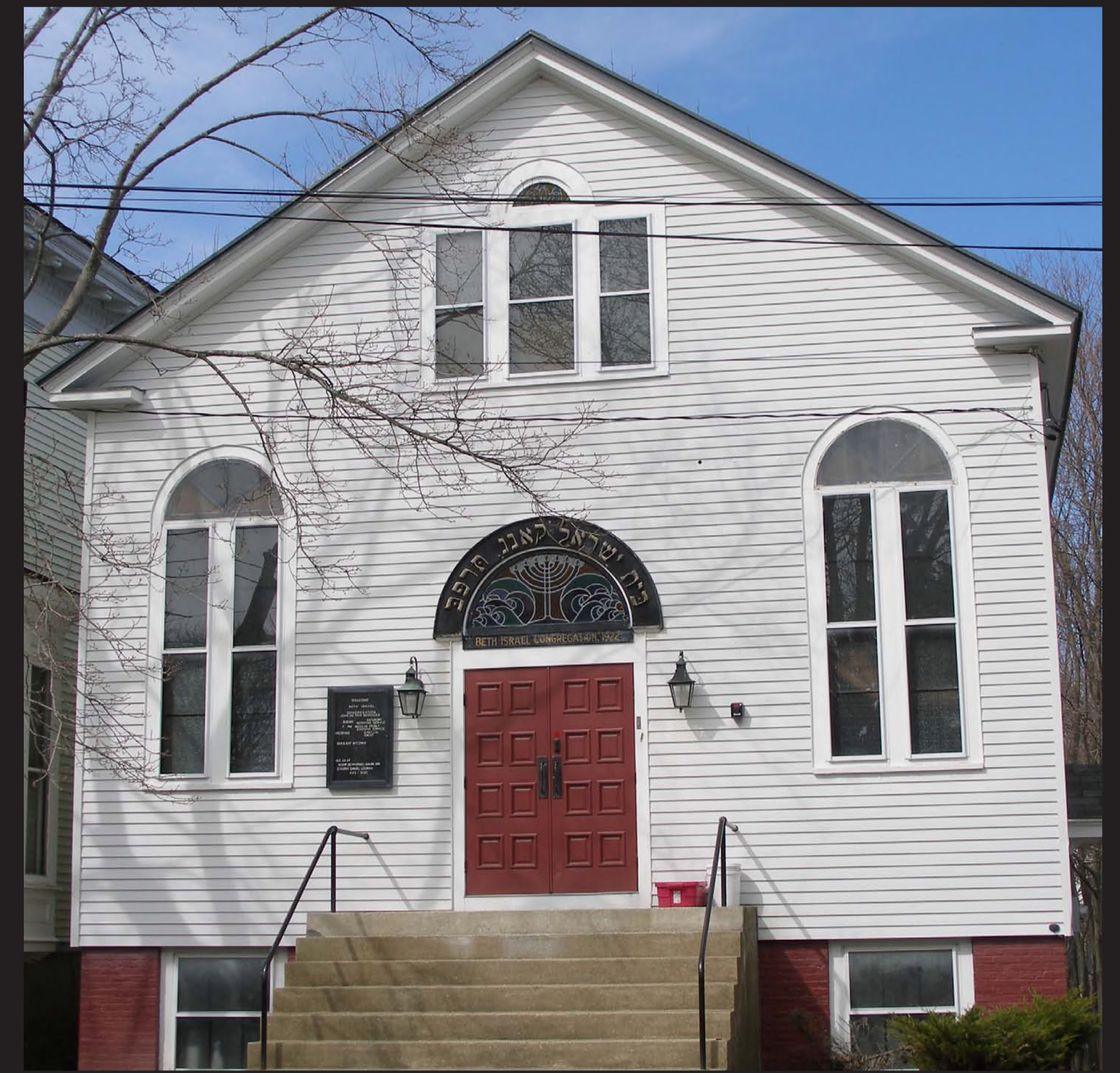
Beth Israel Synagogue in Bath