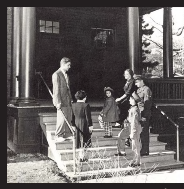
WWII-era servicemen and others on the steps of Bangor’s JCC