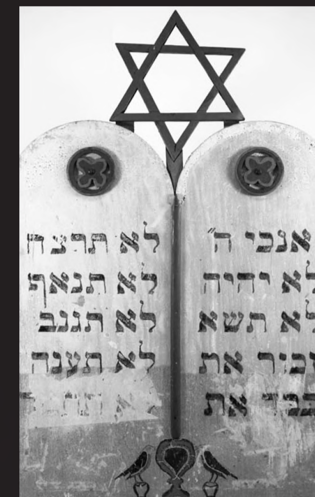
Decalogue tablets, former synagogue in Gardiner

A lthough Maine’s Jewish population has rarely exceeded 10,000, this number has remained fundamentally stable since the 1980s. Concentrated populations of Jews currently reside in and around Augusta, Bangor, Bath, Biddeford-Saco, Lewiston-Auburn, Portland, Rockland and Waterville. Twenty-four synagogues have existed in Maine towns or cities; sixteen continue to serve the community in 2010.