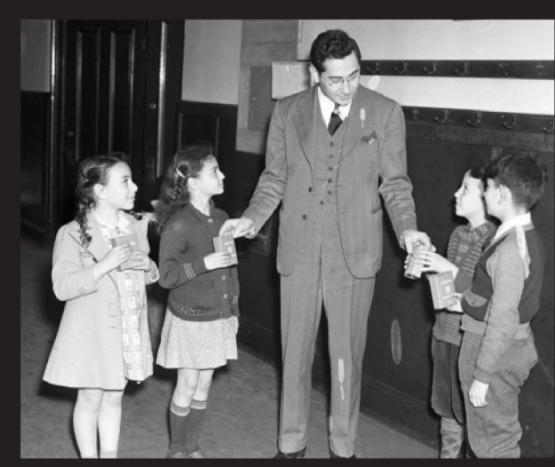
Children with tzedakah boxes or pushkes, 1940s

T he Jews of Maine have had, and continue to have, an impact disproportionate to their number. They have made their marks in Maine and beyond through commercial and entrepreneurial efforts, creative contributions in arts and letters, pace-setting accomplishments in the medical, legal and financial professions, philanthropic munificence and dynamic civic leadership.