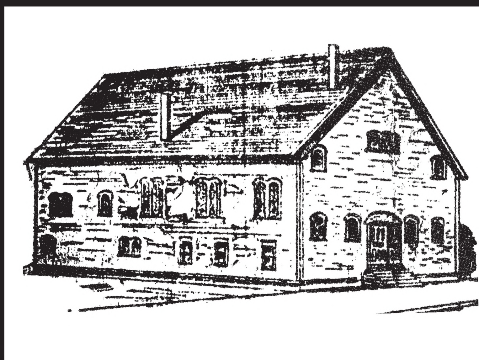
Former Beth Israel Synagogue in Bangor, 1897

T he Jews of Maine have had, and continue to have, an impact disproportionate to their number. They have made their marks in Maine and beyond through commercial and entrepreneurial efforts, creative contributions in arts and letters, pace-setting accomplishments in the medical, legal and financial professions, philanthropic munificence and dynamic civic leadership.