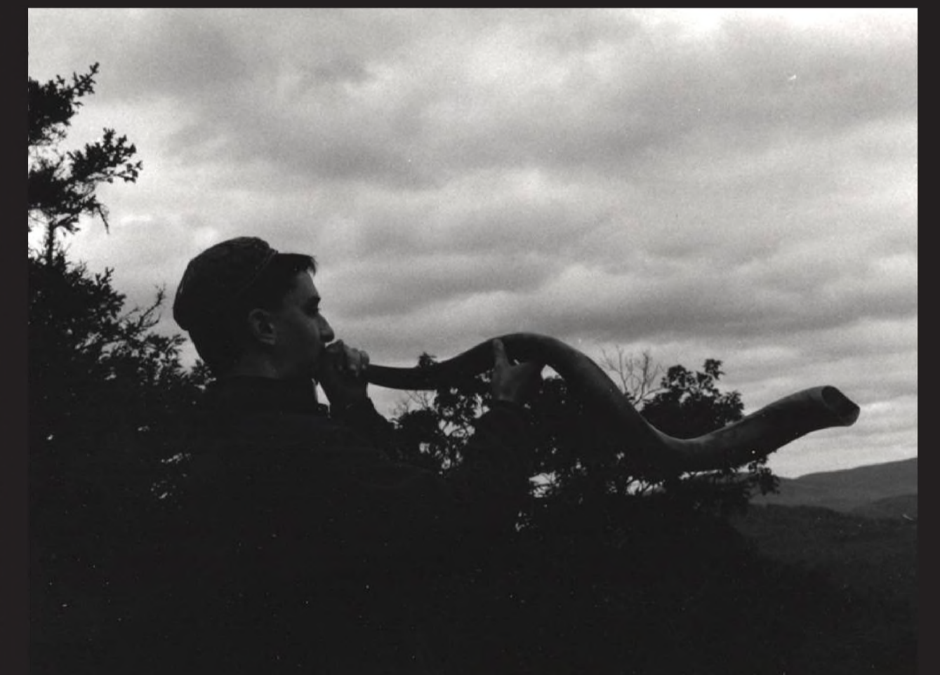
The shofar (ram’s horn) sounds in Weld

In some periods and places Maine’s Jews have been subject to discrimination and exclusion. Over time, however, they have successfully broken down barriers that once limited their access to social clubs, educational and professional opportunities, and the world of politics.